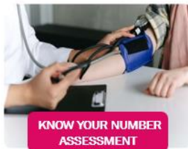
KNOW YOUR NUMBER ASSESSMENT